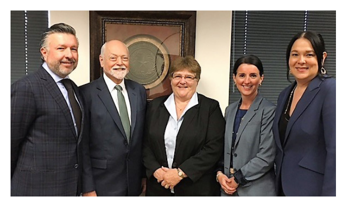
Members of the Texas Assisted Living Association, an Argentum state partner, during an annual Advocacy Day at the Texas state capitol.