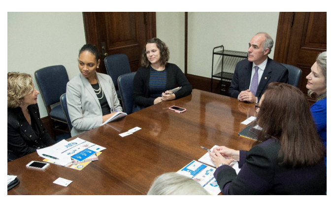
Argentum members engaging with Senator Bob Casey (PA) during the annual Public Policy Institute & Fly-In.

Learn more about past events on our website at argentum.org/ppi.