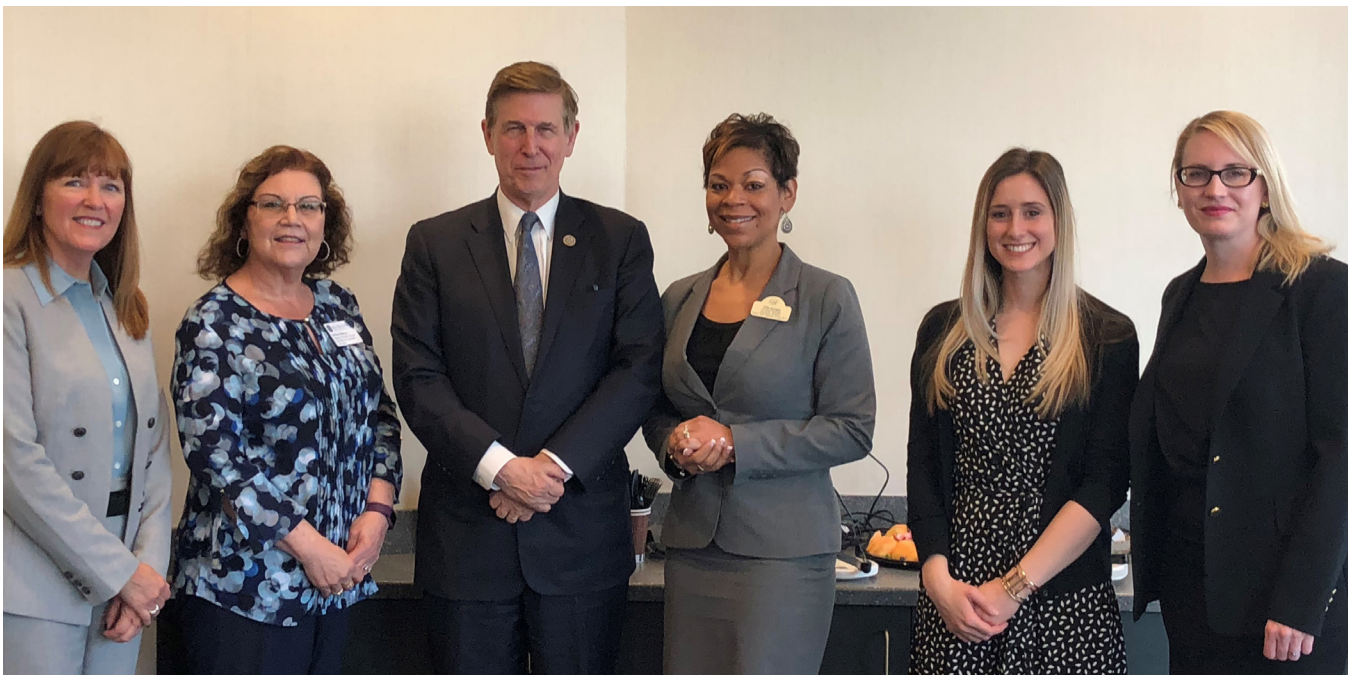
Congressman Don Beyer (VA) visited the Argentum office in Alexandria, Va., along with representatives from Kensington Senior Living, Silverado, and Brandywine Living.