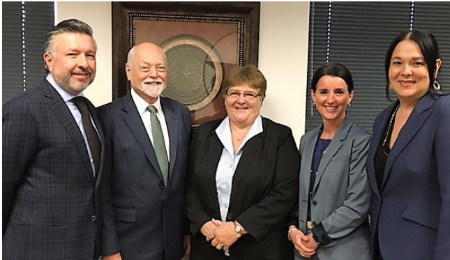
Members of the Texas Assisted Living Association, an Argentum state partner, during an annual Advocacy Day at the Texas state capitol.