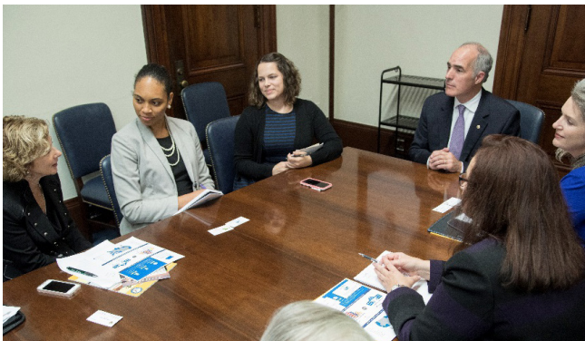
Argentum members engaging with Senator Bob Casey (PA) during the annual Public Policy Institute & Fly-In.

Learn more about past events on our website at argentum.org/ppi .